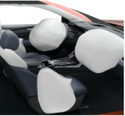
Dual Front and Side Airbags