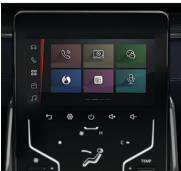
8" Infotainment System