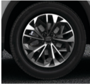
18" Alloy Wheel (Elite only)