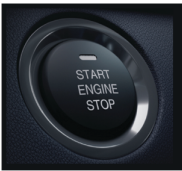
Keyless Entry and Push Start (Elite only)