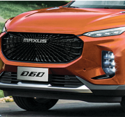
Cobweb Grille and LED Head Lamp (Elite only)