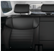
Leather Seats (Elite only)