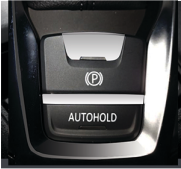
Electronic Parking Brake with Auto Hold