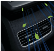
Rear Aircon Vent